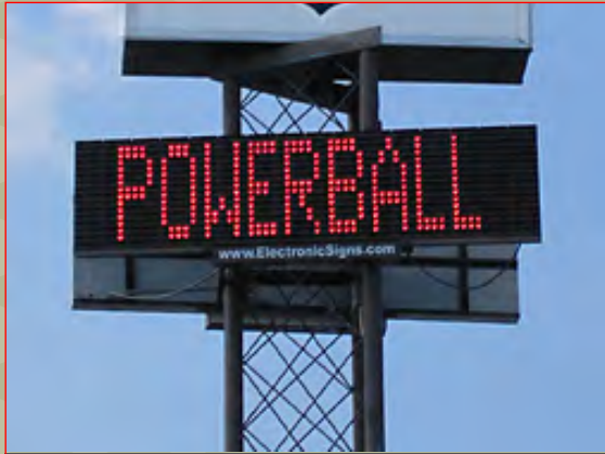
64mm 16 x 64 Matrix Red