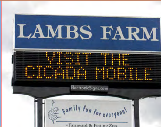
89mm 24 x 80 Amber