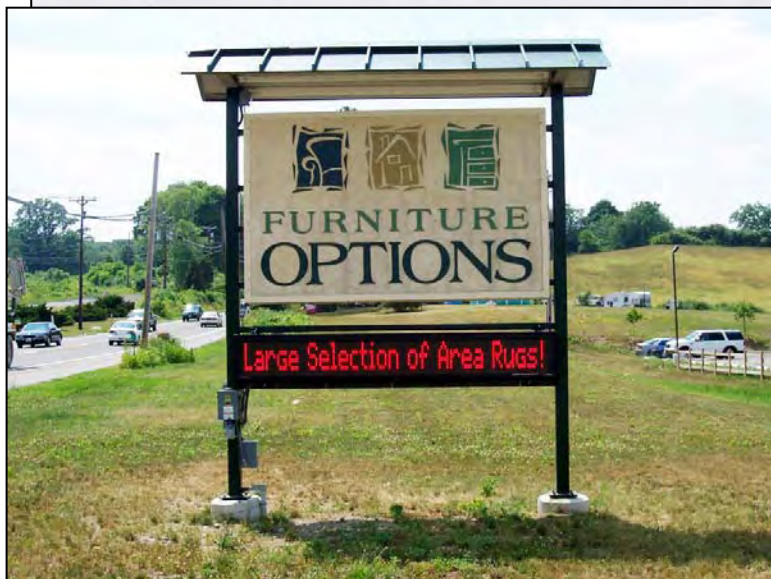
Donald Urmston Furniture Options Goshen, NY